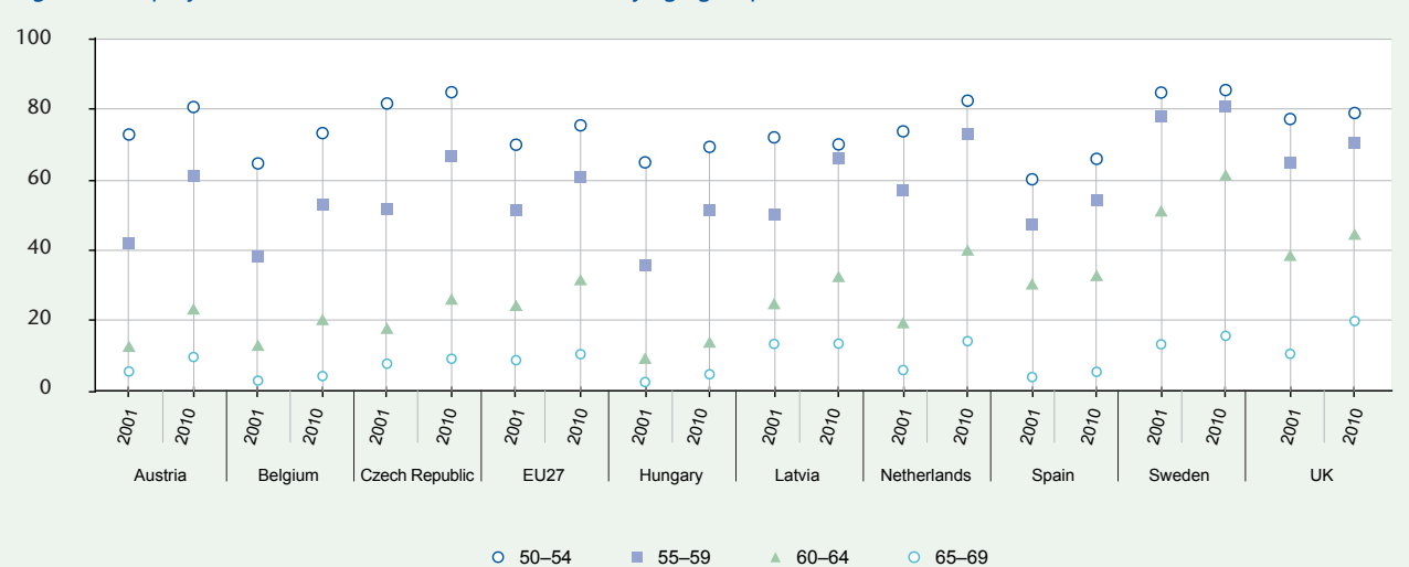
Figure 2: Employment rates in selected Member States by age groups 50–69, 2001–2010(Q2)

Variety of policy instruments prior to current crisis The direction of policy is important in understanding the differences between Member States and between demographic groups within a state. The findings for the nine selected Member States before the economic and financial crisis of 2008–2009 reveal wide variation in the extent to which they implemented policies specifically targeting older workers, and the degree to which they supported older workers through broader employment policies open to all age groups. Corresponding to this, a variety of policy instruments appeared to be in use among Member States before the crisis (and in many cases continue to be in use) to support or maintain older workers in employment. These include more indirect measures that have wider objectives