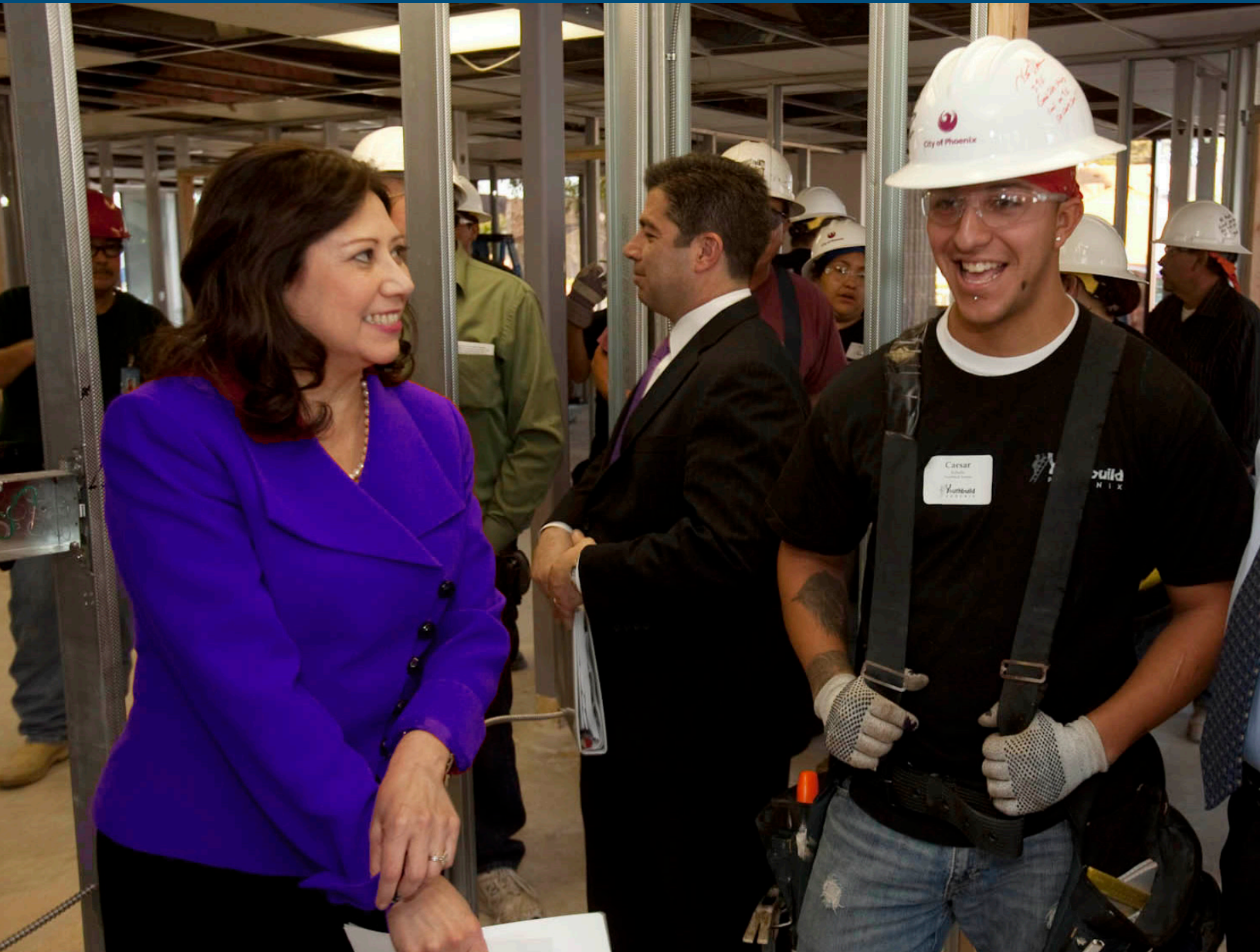
Secretary Solis with a program participant at the Labor Community Service Center in Phoenix, AZ. Students at the Youthbuild site are completing construction on a green building.