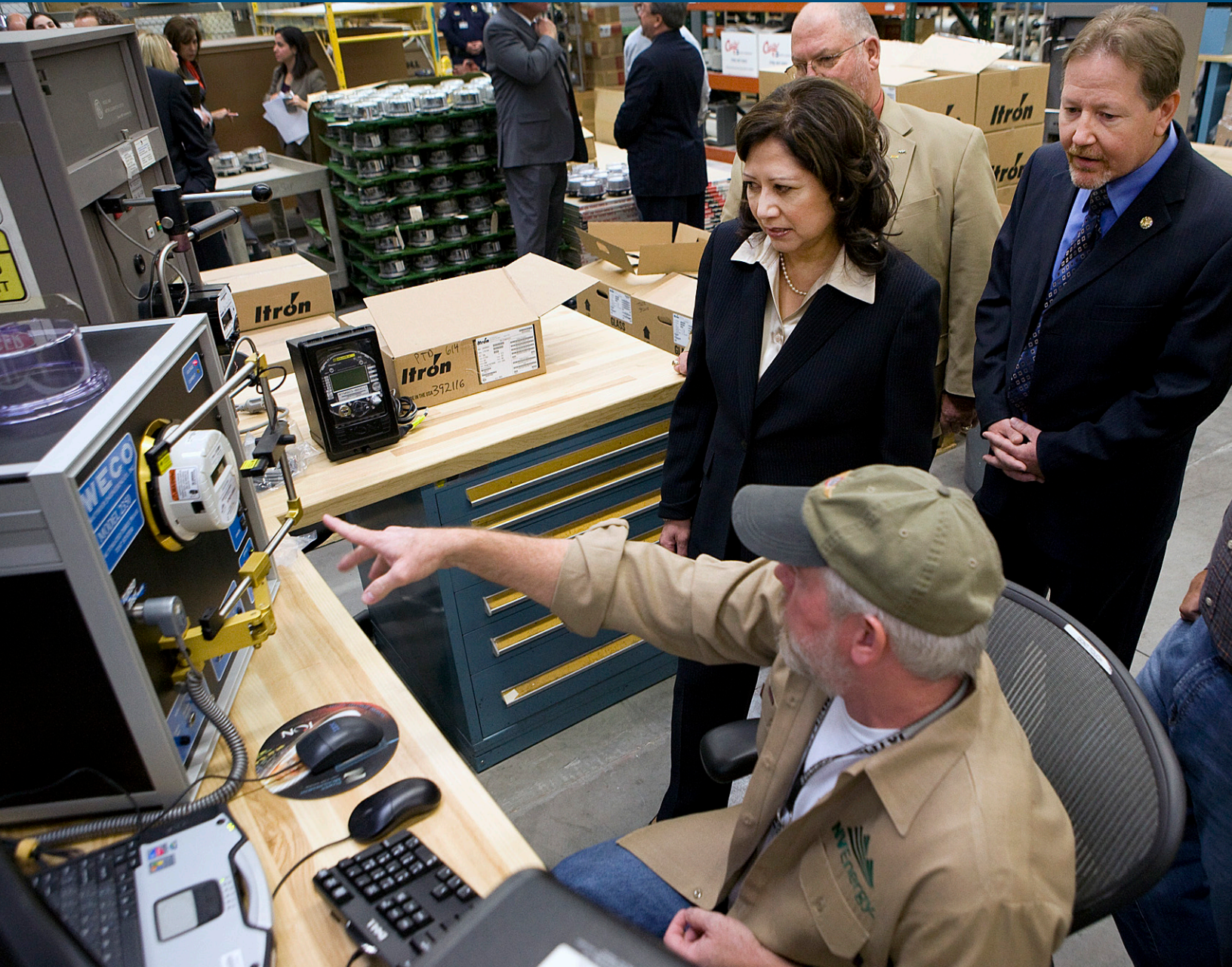
Secretary Solis interacts with an employee at NV Energy in Nevada. The company provides electricity to 2.4 million citizens throughout the state and in northeastern California.