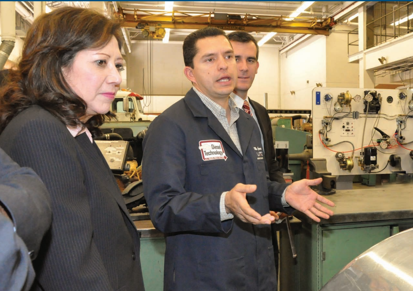
Secretary Solis visits with students at LA Trade-Technical College in Los Angeles where program participants are learning about diesel technology.