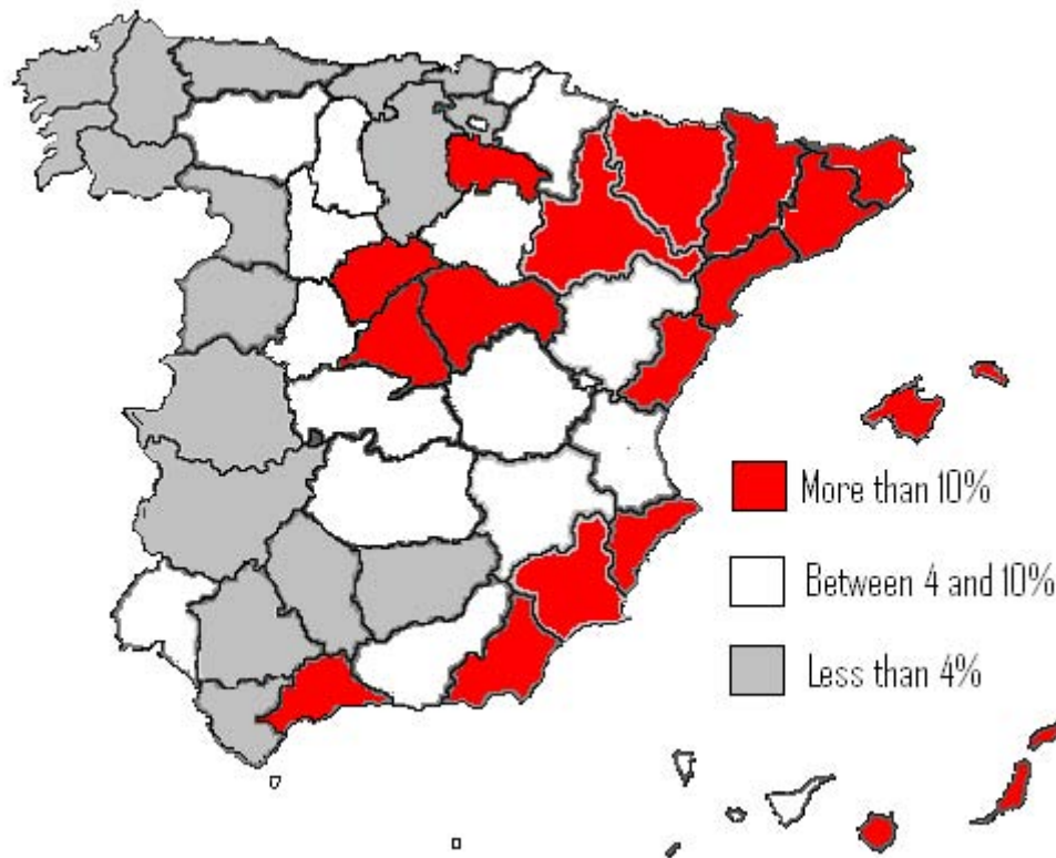
Figure 3: Foreign-born population by Province (Percentage of foreign-born population in total population in 2007)

Note: The figures on the foreign-born population are obtained using data from the Statistical Yearbooks published annually by the Spanish Statistical Office.