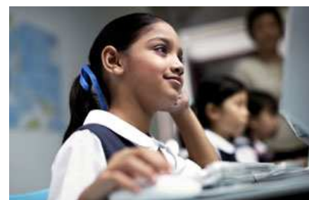
The next generation

The corporate world is doing ever more to address the loss of female talent and the difficulty of combining work with child care. Many elite companies are rethinking their promotion practices. Addleshaw Goddard, a law firm, has created the role of legal director as an alternative to partnerships for women who want to combine work and motherhood. Ernst & Young and other accounting firms have increased their efforts to maintain connections with women who take time off to have children and then ease them back into work.